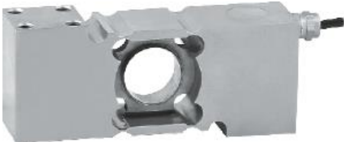
Anyload Model 651KS22 Series Load Cell