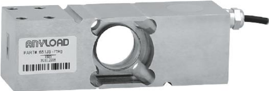
Anyload Model 651JS Series Load Cell