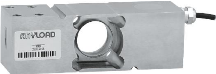
Anyload Model 651KS66 Series Load Cell