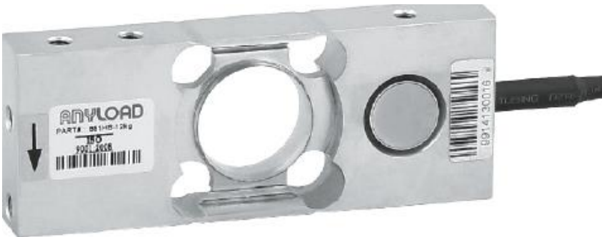
Anyload Model 651HS Series Load Cell