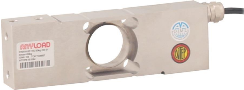
Anyload Model 651TS Series Load Cell