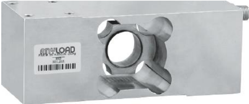
Anyload Model 651KSBC Series Load Cell