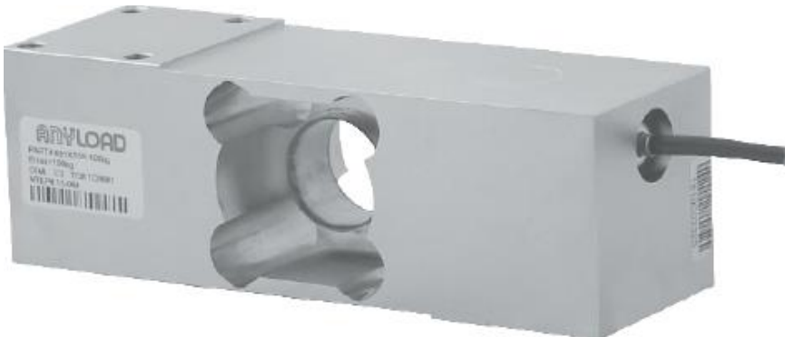
Anyload Model 651KS55 Series Load Cell