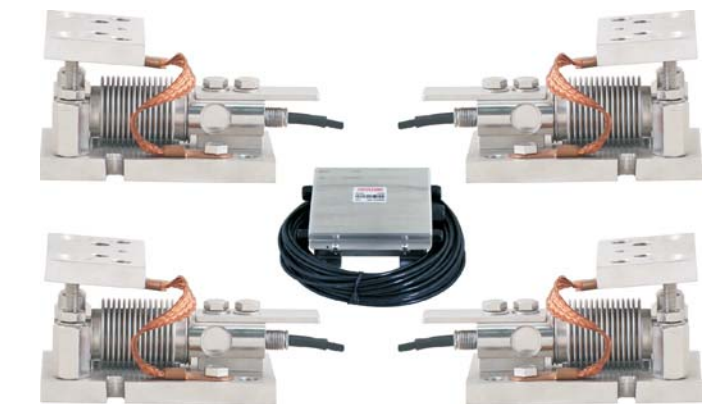
Load Cell Certifications:

The MK4-563RSM5 offers a stainless steel constructed washdown IP68/69K certified waterproof product. Ideal for chemical-and food-related applications, the kit provides outstanding performance in hostile environments, built to last in any messy situation. The OIML and NTEP approved load cells deliver accurate readings for lower capacities up to 200kg. Common applications include batching/blending and chemical/food processing. Two slots on the baseplate facilitate ease of use. Each kit comes with an IP67 water-resistant junction box and 65ft of cable.